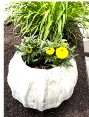
The Garden at Hospice house